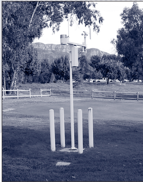
ET Station at Soule Park Golf Course.

Farmers, business owners and residents will be able to save more water by accessing up-to-the-minute weather data that will be made available on Casitas' Web site at www.casitaswater.org this summer. The weather data will provide information on how much water is needed for individual plants, landscapes or crops. Casitas has contracted with the Soule Park Golf Course to be able to broadcast the weather data from their weather station to Casitas' Web site, www.casitaswater.org . The data will be available on a continuous basis. The weather station offers Evapotranspiration (ET) data that will allow