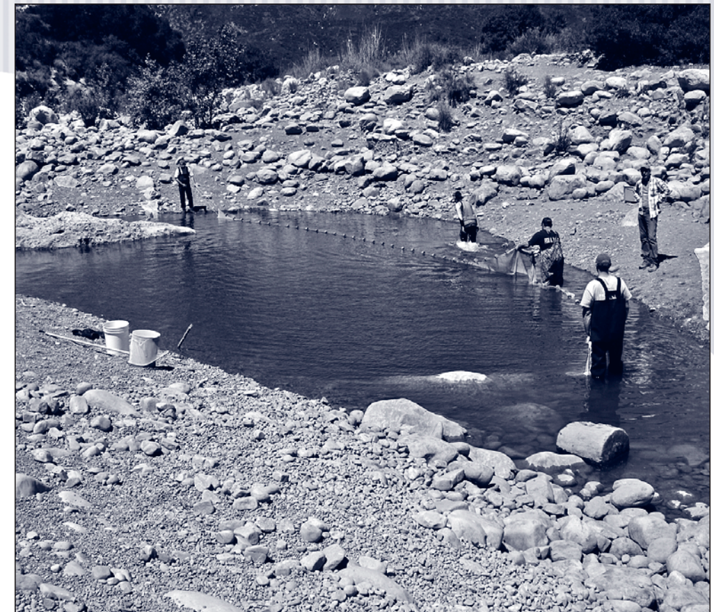
State and Federal personnel rescue endangered steelhead trapped in an enclosed pool

In May, federal and state agencies performed a rescue of steelhead trout from the dwindling pool on the lands owned by the Ojai Land Conservancy. The federal agency, the United States National Oceanic and Atmospheric Administration (NOAA) issued themselves an emergency permit to handle and relocate the dozen trout to other areas of the Ventura River Watershed. Casitas' fisheries staff assisted with the trout relocation efforts. By mid-May of each year, the Ventura River, reaching from Myers Road (Meiners Oaks) to the confluence of San Antonio Creek, historically loses its surface flows and pools that support fish life. The approximate one hundred trout that were spotted in pools during April are thought to have migrated to either upper or lower reaches of the Ventura River. Casitas and the resource agencies are continuing to work together to recover steelhead populations in the Ventura River.