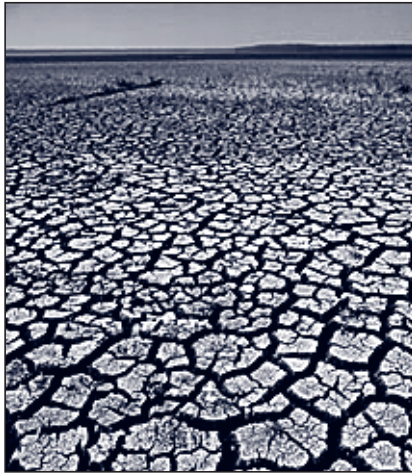
Without water conservation, Lake Casitas could go dry.

The Casitas Municipal Water District is asking customers to conserve more water. Western Ventura County is one of a few areas in Southern California that relies exclusively on local rainfall for its water supplies rather than on imported water, and those supplies are beginning to be impacted by the current drought. Western Ventura County includes the cities of Ojai and Ventura.