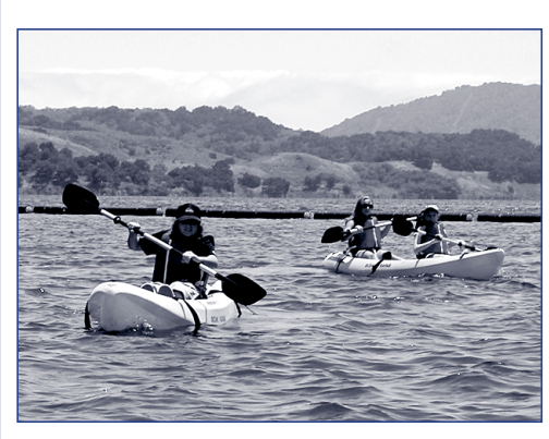
Casitas Recreation Area has many amenities, including boat and overnight trailer rentals, two boat launch ramps and a lakeside café.

features more than 400 campsites; day use areas; two boat launch ramps; an upgraded digital satellite television signal for hook-up sites; and free movies at our outdoor theater in the park for campers.