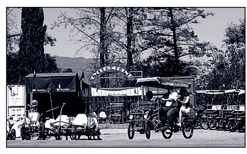
All types of bike rentals are now available at the Lake Casitas Recreation Area.

Continued recreational use of Lake Casitas is contingent upon compliance with regulations to protect the water supply. Since Lake Casitas is a domestic drinking water supply, no body contact with the water is allowed. Water skiing, swimming and wading are thus not allowed. Since 1974, the federal government has spent more than $25 million to purchase watershed