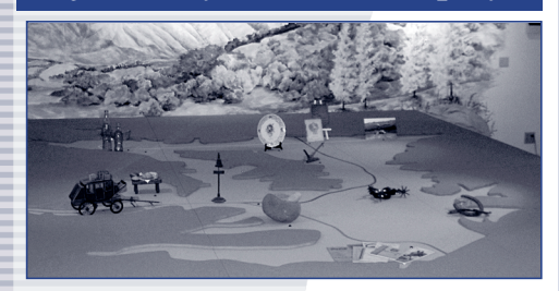
The Ojai Valley Museum's Lake Casitas model is now on display as part of "The Land Beneath the Lake" exhibit.