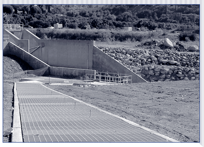
Covering over the new fish passage facility entryway located at the Robles Diversion Facility on the Ventura River.

"Keep us current on the fish ladder and Matilija issues."