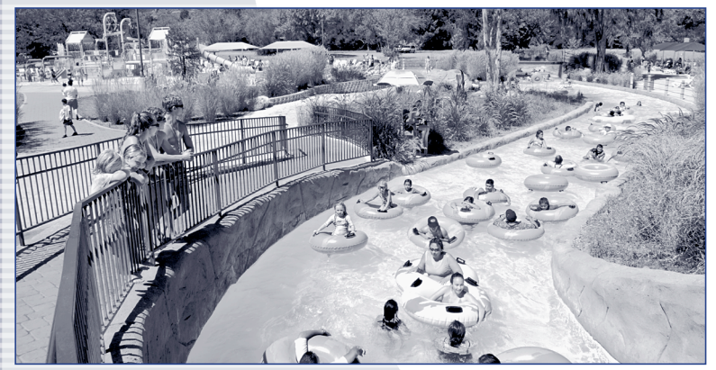
VCREA completed an investigation of the Lake Casitas Water Park in May with potential energy savings.

Casitas joined the Ventura County Regional Energy Alliance (VCREA) in an effort to keep District expenses down. Electrical costs comprise between 10 and 15 percent of Casitas' total budget. The VCREA was formed in January 2002 as a pilot program to help local communities establish a regional energy office. VCREA provides funding for specific energy efficient retrofits, such as the replacement of high-cost lighting or inefficient motors and pumps, to help public agencies like Casitas decrease their energy bills. VCREA completed an investigation of the Lake Casitas Water Park on May 26, 2005. The study identified energy-related measures that would cost only $28,177 to implement but would result in energy savings of $10,803 per year. That equates to a 2.6-year payback, or a 38 percent return on an investment.