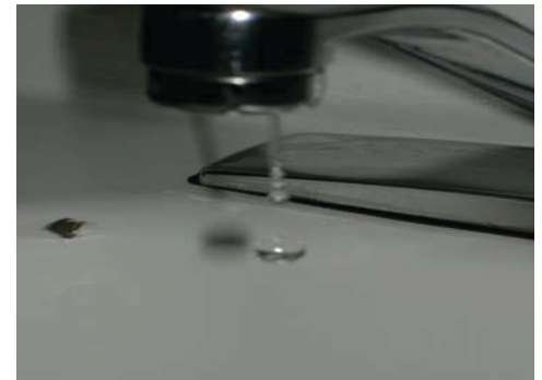
A leaky faucet can lose 50 gallons a day.

Receive a free home water survey for both your indoor and outdoor water usage. Our trained personnel can help you find the best ways to save money on your water bills. This includes doing a meter check to determine if you have any water leaks on your property. We will also provide you with free water saving devices and information on our rebate programs. Please call for an appointment at (805) 649-2251 Extension 128.