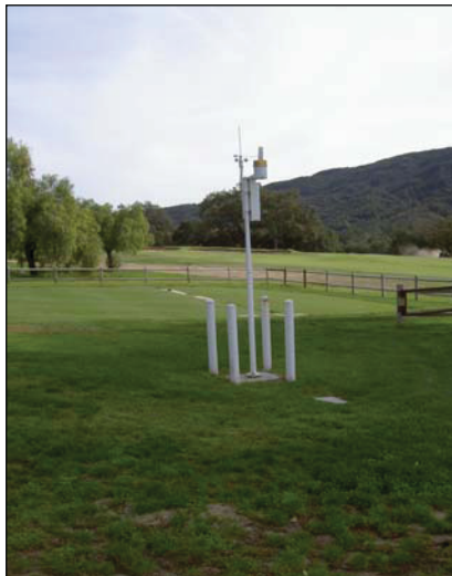
Soule Park ET Station

Visitors to the site can find real time weather information to include Evapotranspiration (ET) data for the Ojai Valley. ET data can be used to modify landscape irrigation more efficiently. The Ojai ET station at Soule Park, where the information is generated, is shown in the photo on the right.