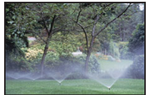
Lawns use lots of water during the long days of summers.

It is time to reset your irrigation timer to start watering fewer days and times. As daylight periods become shorter, reduce the amount of water you apply to your plants and lawns, even if the fall temperatures remain warm.